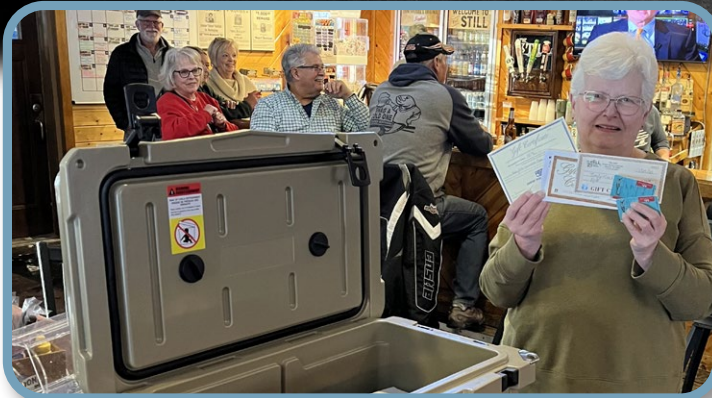
Mystery Cooler Winner